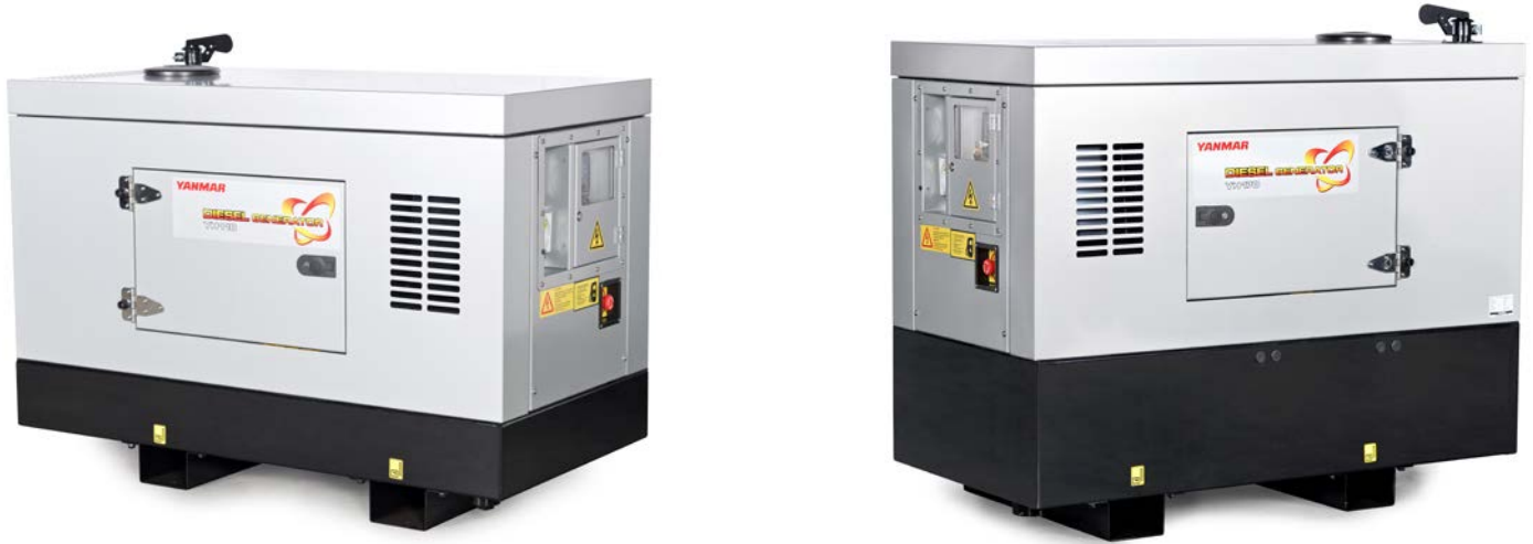
Optional large capacity fuel tank available (LT)

4 Pole, Single Phase, Silent type Generator output 6.6 – 29.2kVa